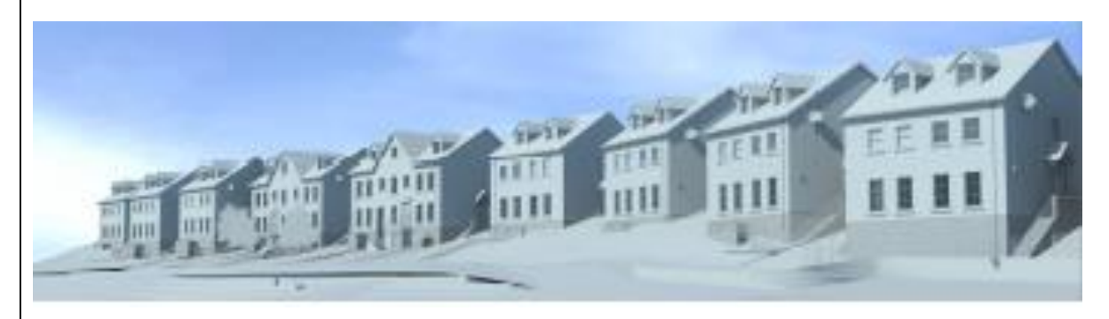
Fig 3. (below) 3D Impression of street view