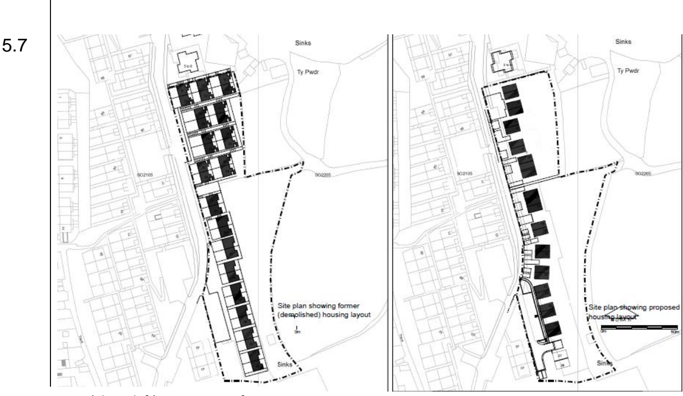
Fig 4 (above left): Site Layout of previous housing on the site prior to demolition.